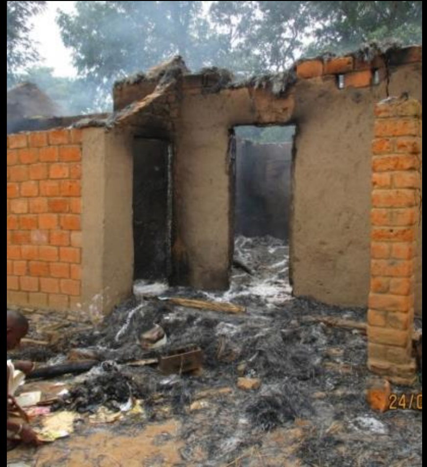
Massacre of Liwa CAR 2014