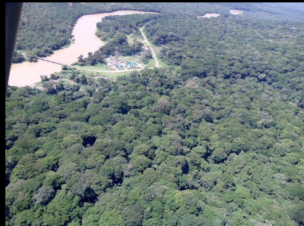
Semuliki DRC 2017