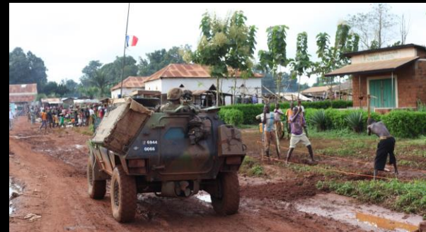
French Operation Barkhane