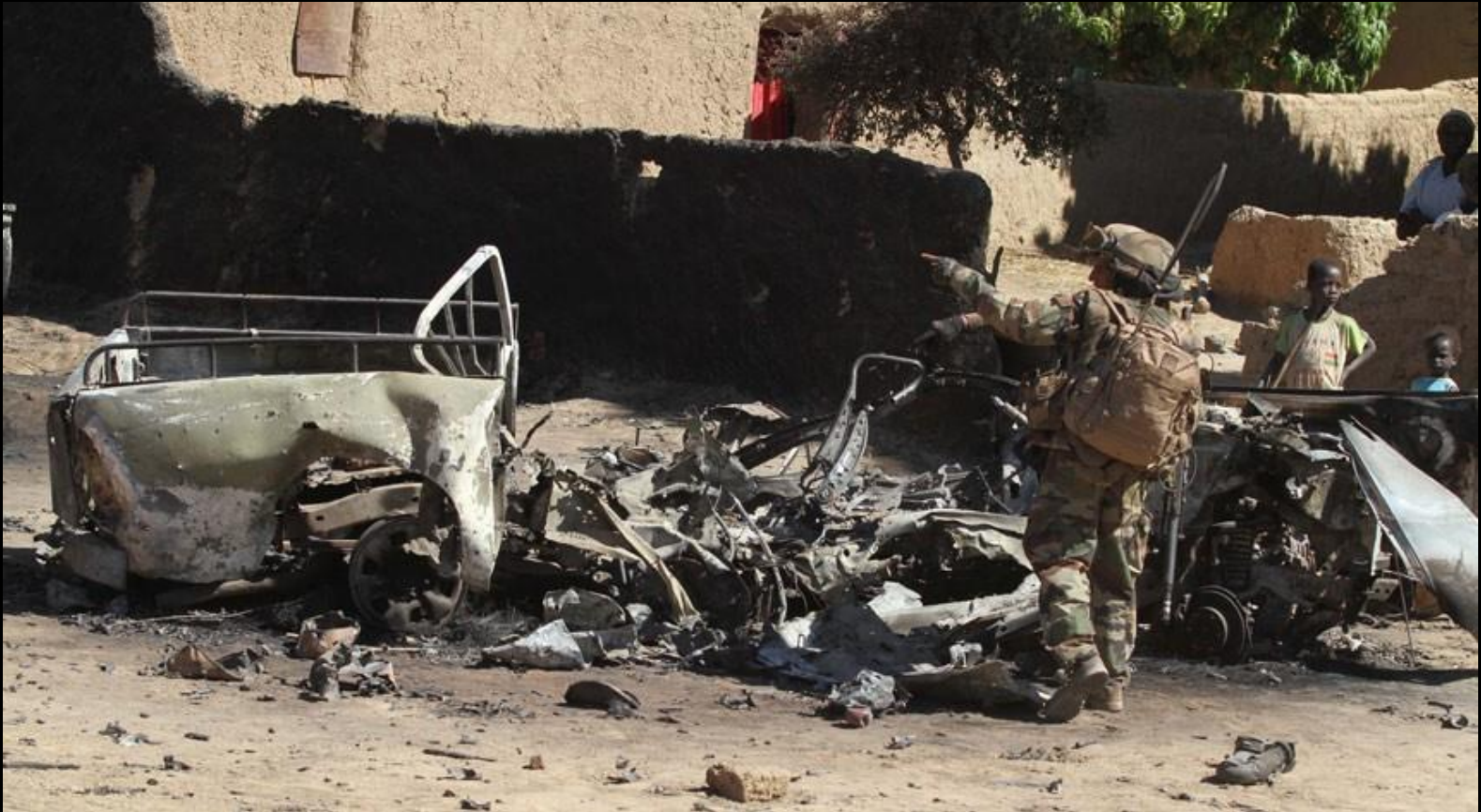
Suicide bomb Mali 2014