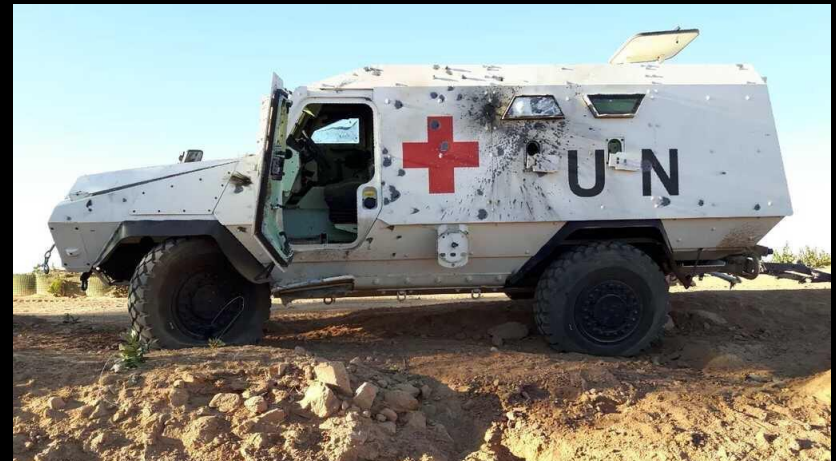
Attack on MINUSMA troops in Mali 2019